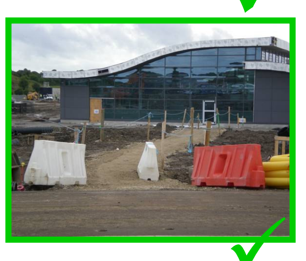
For further information on Health and Safety related issues go to www.hsa.ie